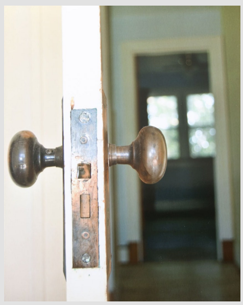
The Open Door Leah Ortowski, Mountain View ARCH