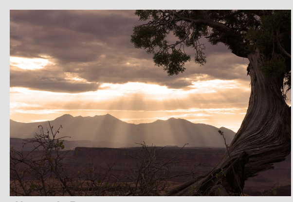
Heavenly Rays Bryce Drehle-Ewan, Polaris Exp LS SCAP