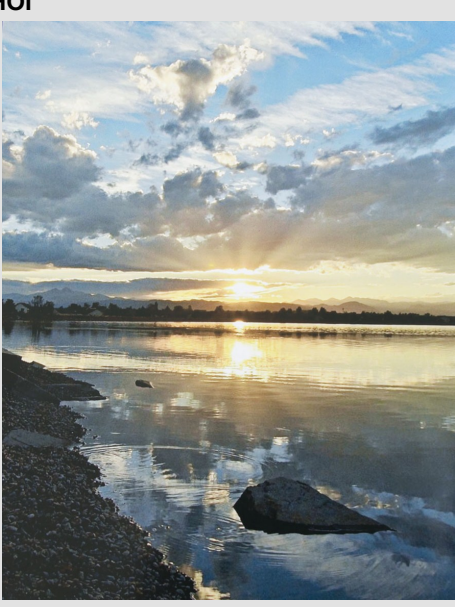
All Things Resplendent Leah Ortkowski, Mountain View SCAP