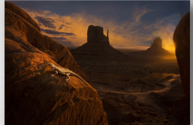
Desert Sunrise — Ruth Spain