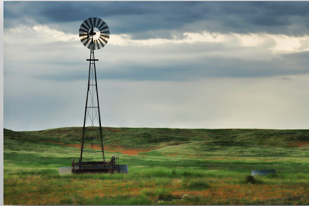
Pawnee Buttes — Tim Hitchcock