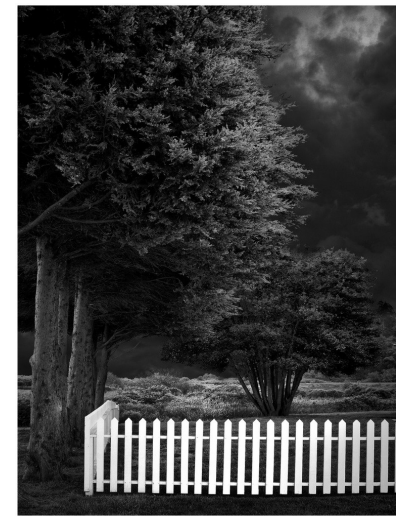
White Fence and Trees