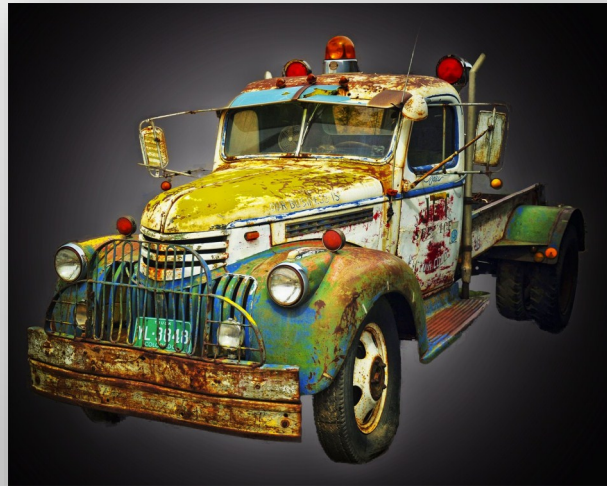
Victor Tow Truck — Tim Hitchcock