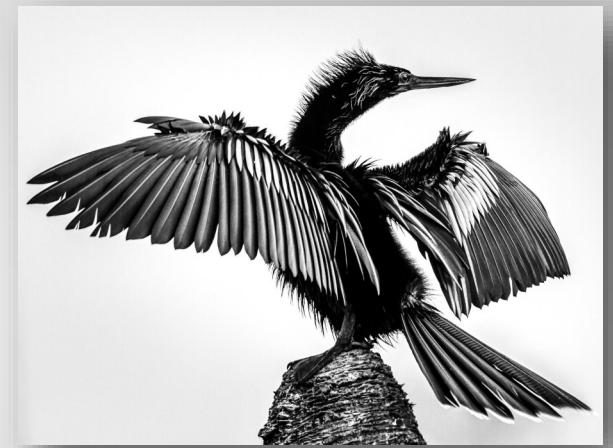
Anhinga