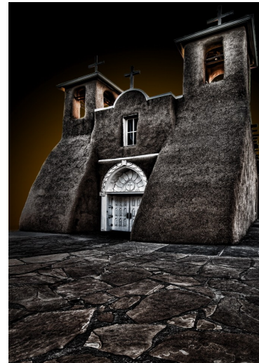
In San Francisco de Asis No. 2