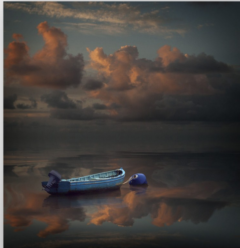
AOM Tranquility