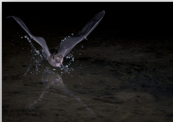
Pallid Bat Drinking