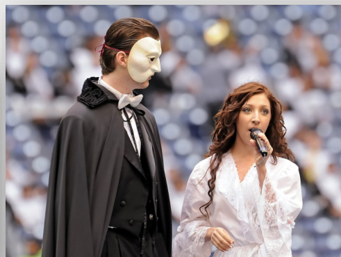
Phantom — Harvey Dunn