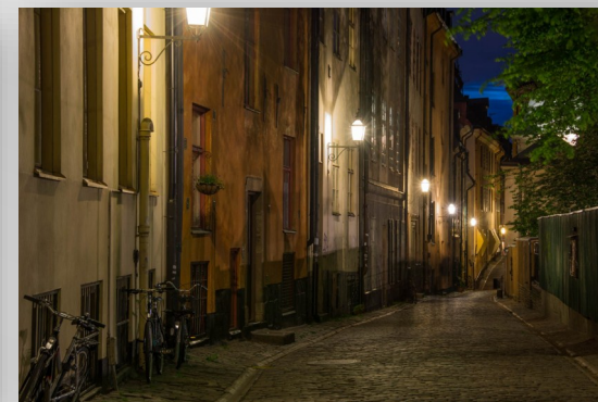
Gamla Stan Street at Night — Rich Krebs