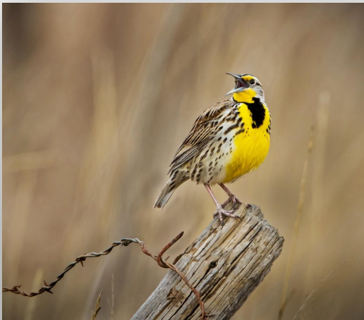
Meadowlark on a Post