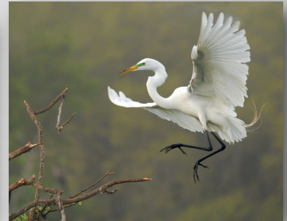
Great Egret in for a Landing