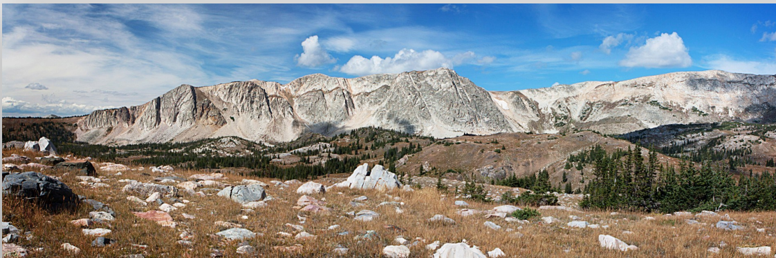
The Snowy Range