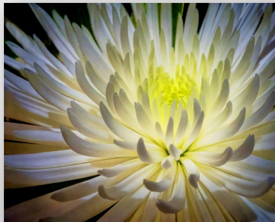
Flower Lamp — Josemaria quera