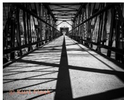
AOM Monochrome, Group 4 Kurt Flock