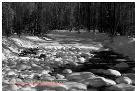
AOM Monochrome, Group 5 Gerald Baumann