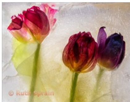
AOM Open, Group 5 Ruth Sprain