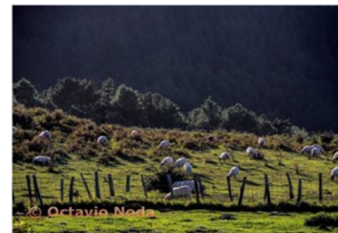
AOM Open, Group 3 Octavio Noda