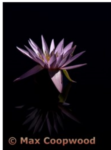
AOM Open, Group 4 Max Coopwood