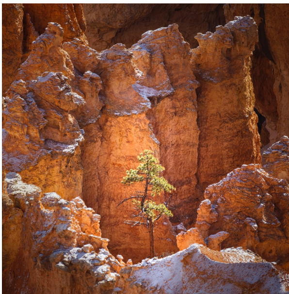
"Finding the Light"—Jeanie Sumrall-Ajero

flickr.com/photos/the-digital-jeanie/ facebook.com/jeaniesa