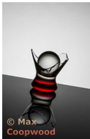
AOM Open, Group 4 Max Coopwood