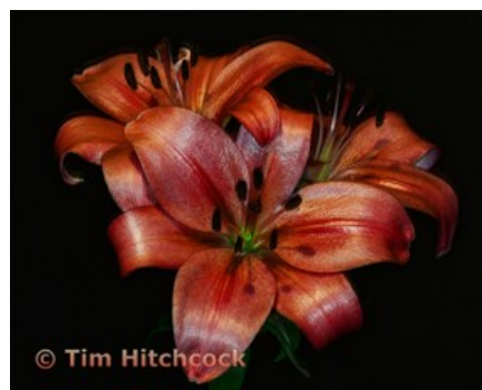
BOS Topic, Group 3 Tim Hitchcock