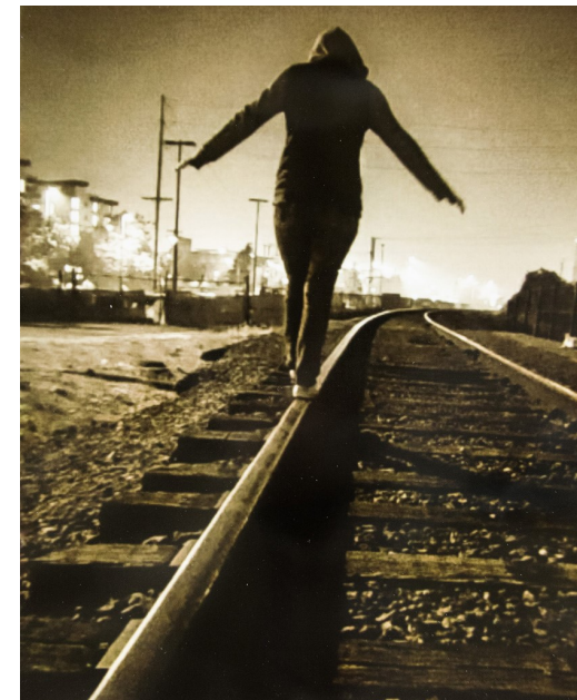
"Train Track to Nowhere"—Emily Hufford