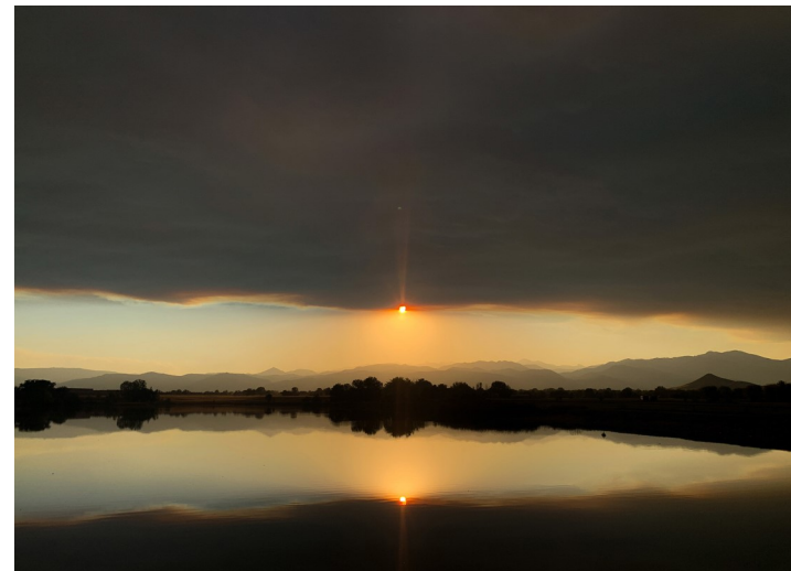
"A Sliver of Serenity"—Luke Werner