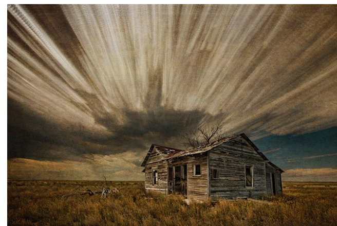
"The Old Homestead"

"Photography is the process of creating future memories. My work is my language: I view the world in terms of their form and beautiful light. The hope of my art is to hold for you, in the subsiding of life's rush, the beauty of Visual Moments."