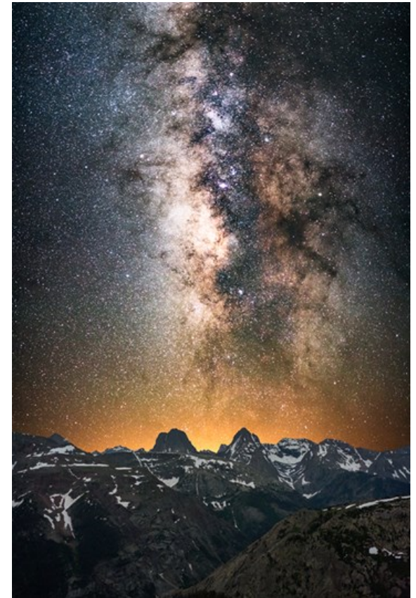
Milky Way 1

Find more about Matt online at mattpaynephotography.com .