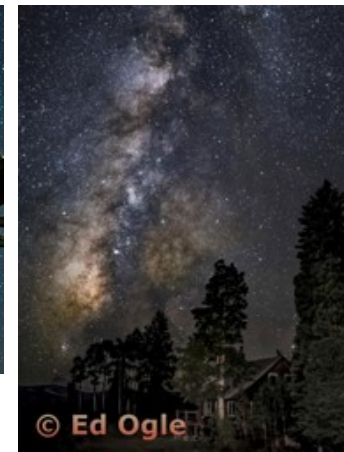
AOM Topic, Group 4 Ed Ogle