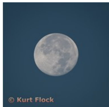
BOS Topic, Group 3 Kurt Flock