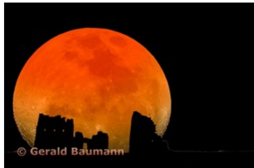
AOM Topic, Group 5 Gerald Baumann