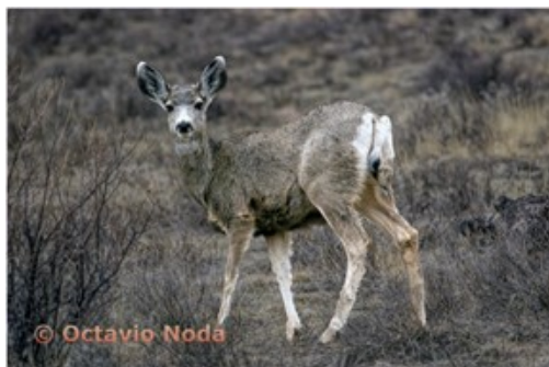
AOM Nature, Group 4 Octavio Noda