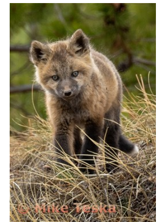
BOS Nature, Group 3