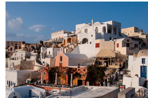
Oia 3 —Rich Krebs