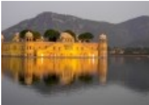
AOM Travel, Group 5 Lisa Schnelzer