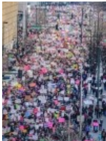
AOM Topic, Group 3 Ed Ogle