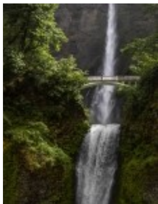
BOS Travel, Group 3 Ed Ogle