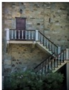
BOS Open, Group 2 Octavio Noda