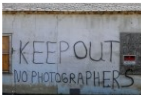
BOS Topic, Group 2 Octavio Noda