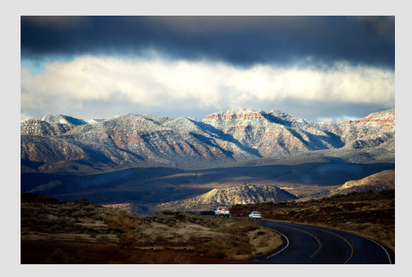
On The Road To Utah Jennette Valenzula, Picken tech Scape