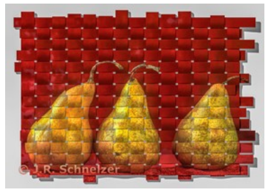
AOM Topic, Group 5 J.R. Schnelzer