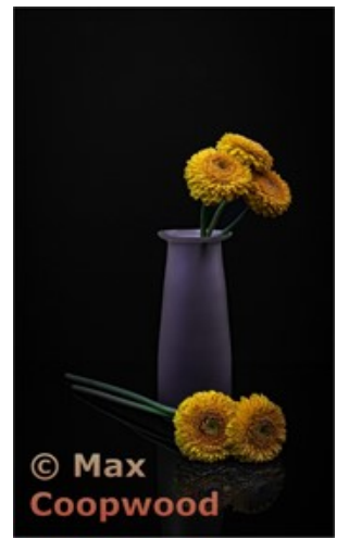
BOS Topic, Group 5 Max Coopwood

All competition photos and scores can be viewed on the LPS website under Competition Results. Check the box "Display All."