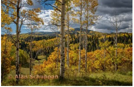
AOM Open, Group 4 Alan Schuppan