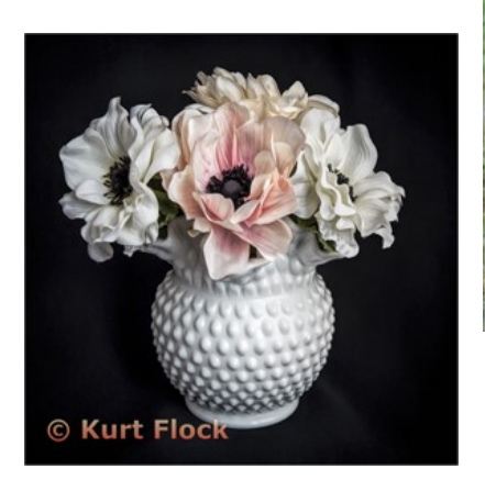
AOM Topic, Group 3 Kurt Flock