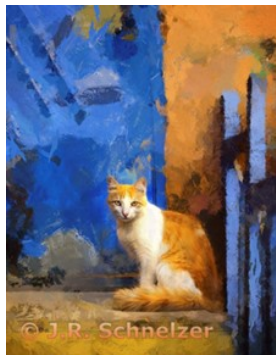
AOM Topic, Group 5 J.R. Schnelzer