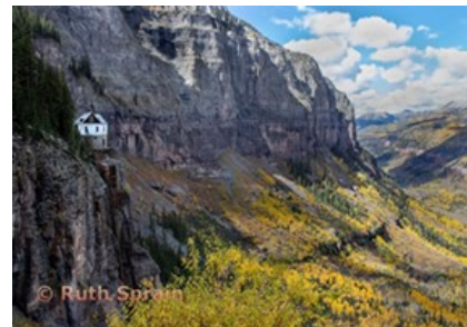
AOM Travel, Group 5 Ruth Sprain