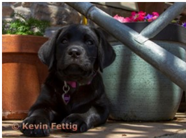
AOM Topic, Group 4 Kevin Fettig