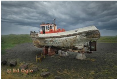
AOM Open, Group 5 Ed Ogle