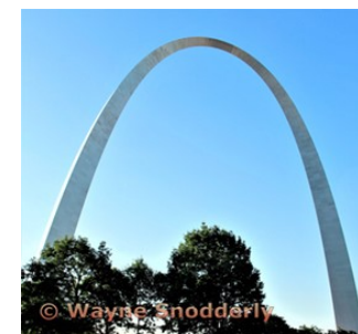
BOS Travel, Group 2 Wayne Snodderly