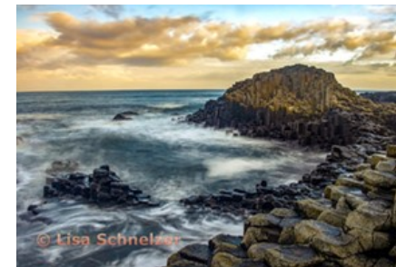
AOM Travel, Group 5 Lisa Schnelzer