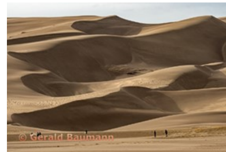
AOM Travel, Group 4 Gerald Baumann