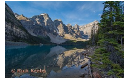
AOM Travel, Group 3 Rich Krebs