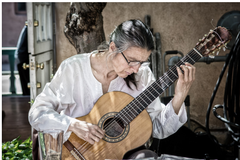
Ordinary Life in D Minor