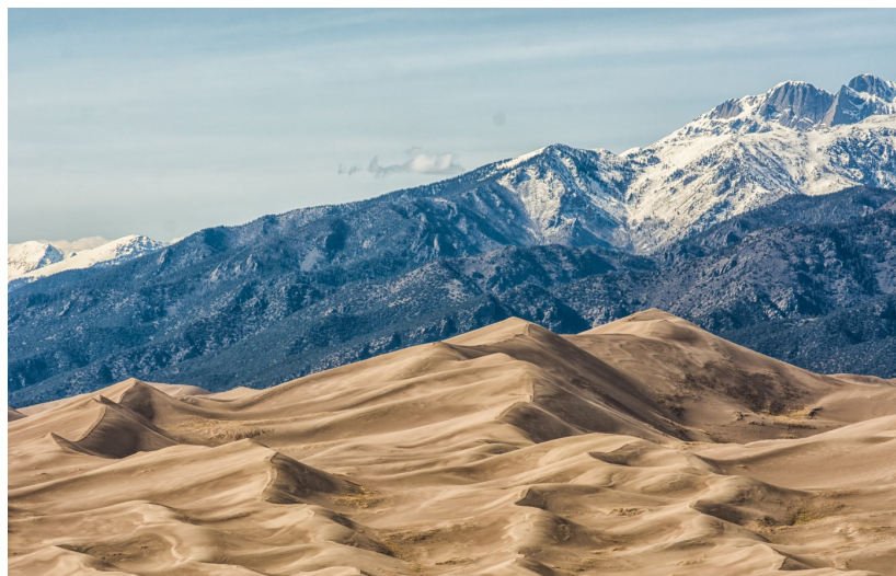
Great Sand Dunes