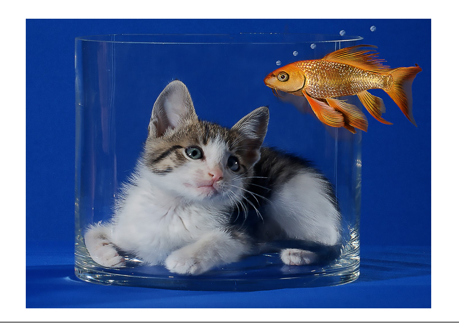
How Did That Happen?