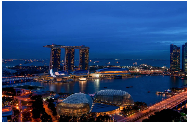
Singapore Harbor—Rich Krebs