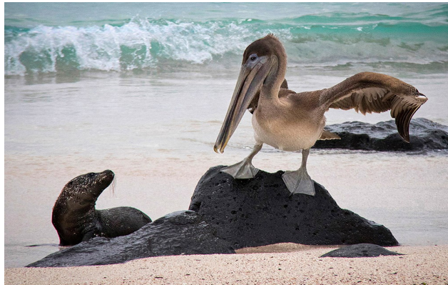
Unexpected Guest—Ruth Sprain