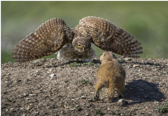
Burrowing Owl Fierceness—Ardeth Carlson