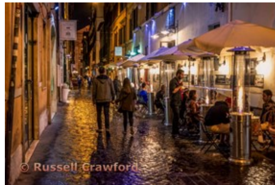
BOS Travel, Group 4 Russell Crawford