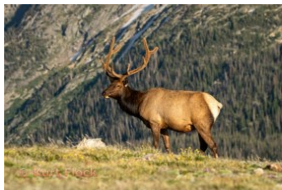
AOM Open, Group 4 Kurt Flock