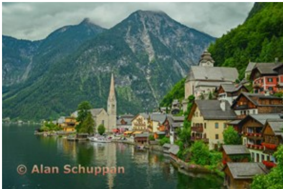
AOM Travel, Group 4 Alan Schuppan