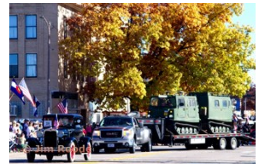
BOS Topic, Group 2 Jim Roode