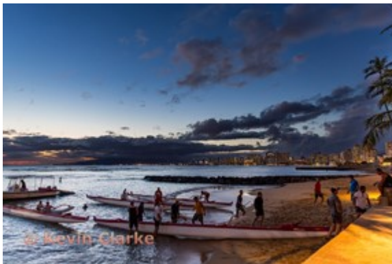
AOM Travel, Group 3 Kevin Clarke