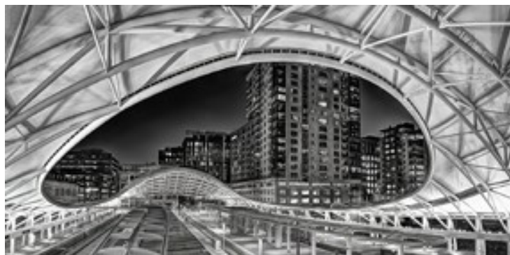
Union Station Pano J.R. Schnelzer