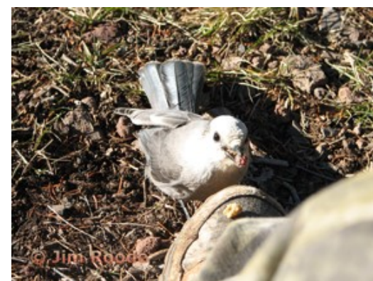
AOM Open, Group 2 Jim Roode