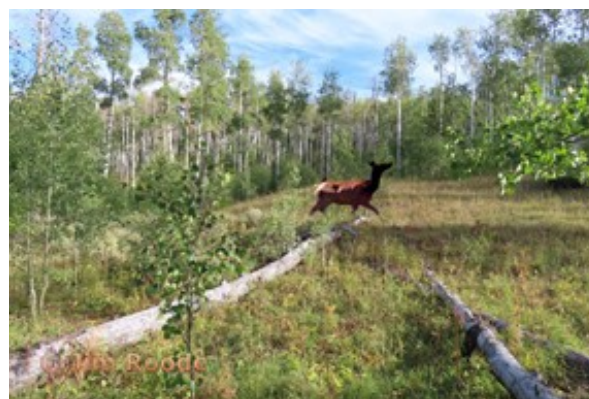
BOS Topic, Group 2 Jim Roode