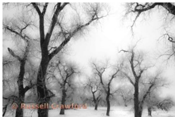
BOS Monochrome, Group 4 Russell Crawford