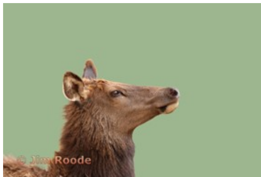
BOS Topic, Group 2 Jim Roode