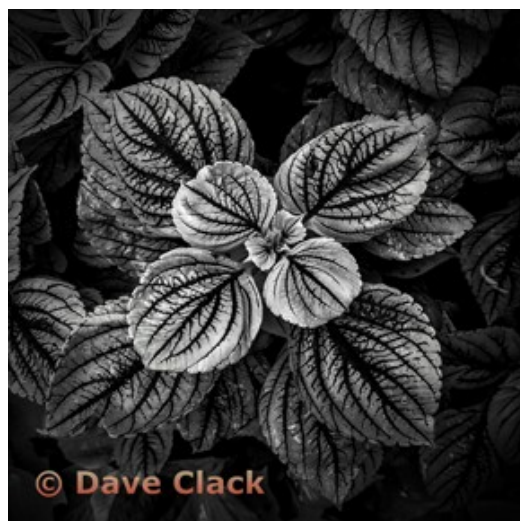
AOM Monochrome, Group 5 Dave Clack