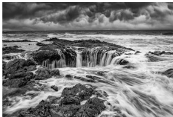
Thor's Well —J.R. Schnelzer Honorable Mention Large Monochrome