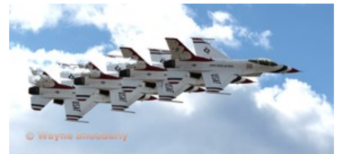
AOM Topic, Group 2 Wayne Snodderly