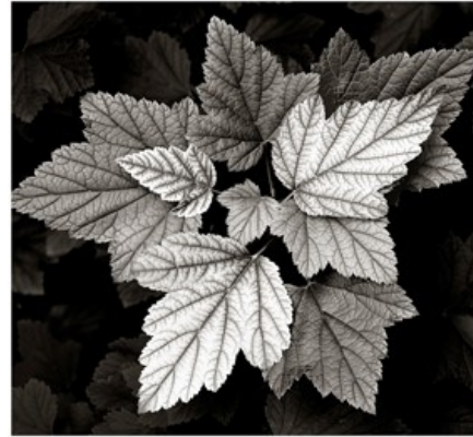
Leaf Study #1 —Dave Clack 3rd Place Large Monochrome