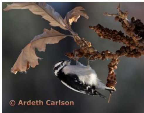
AOM Topic, Group 5 Ardeth Carlson