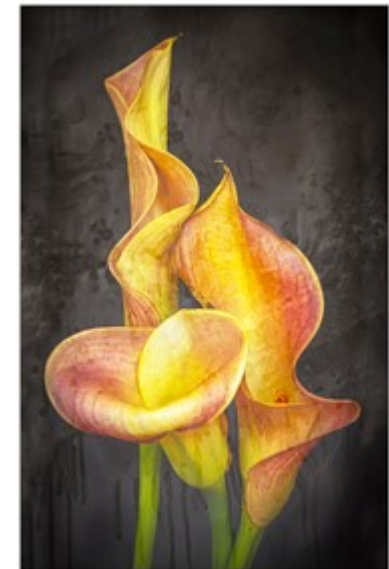
Mystery of the Calla —Ruth Sprain Honorable Mention Small Color