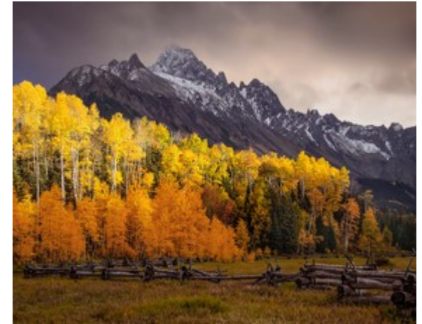
Sunlit Aspens —Dave Clack 2nd Place Large Color