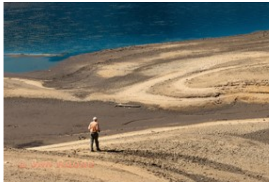
BOS Topic, Group 2 Jim Roode