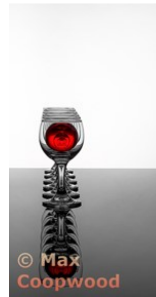
AOM Topic, Group 4 Max Coopwood