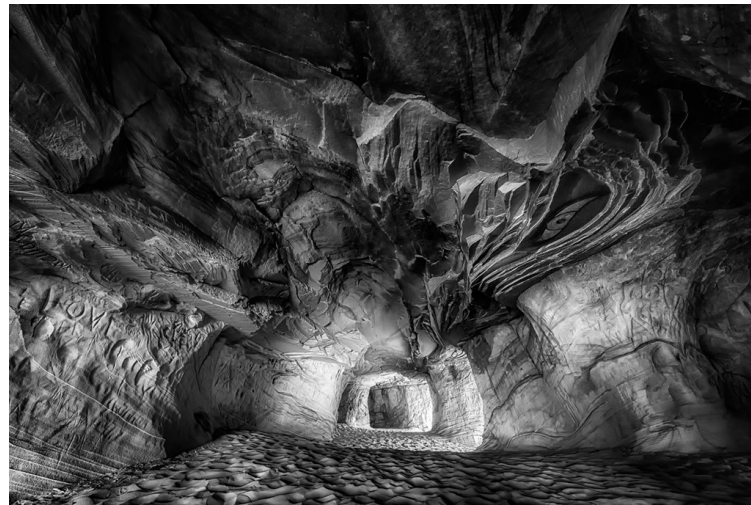
"Inner Turmoil"—Jeanie Sumrall-Ajero