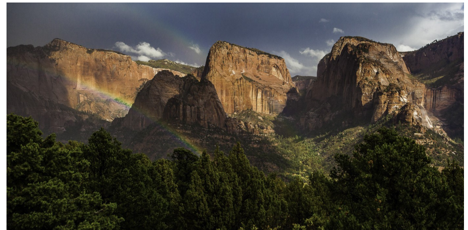
“Kolob Canyon Rainbow”—Guy Turenne