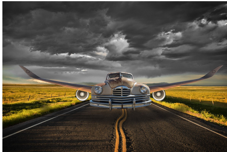
"The Future of Cars"—J.R. Schnelzer