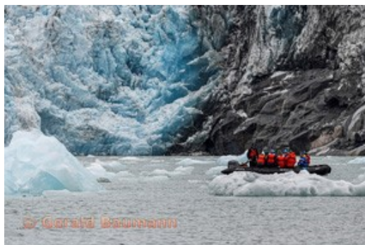
AOM Travel, Group 4 Gerald Baumann