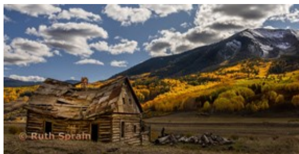
AOM Topic, Group 4 Ruth Sprain