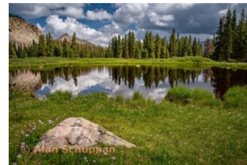
BOS Topic, Group 4 Alan Schuppan