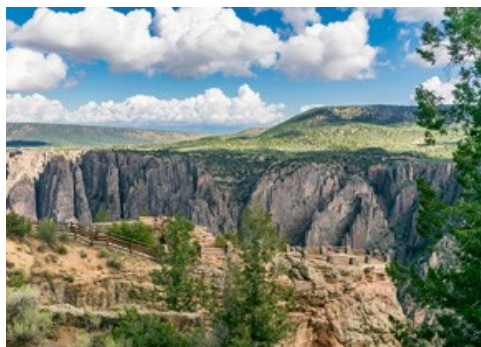
AOM Topic, Group 5 Dan O'Donnell