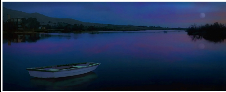
Boat and Moon - Josemaria Quera