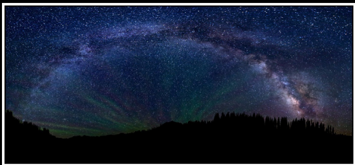
Milky Way Air Glow - Kevin Clarke