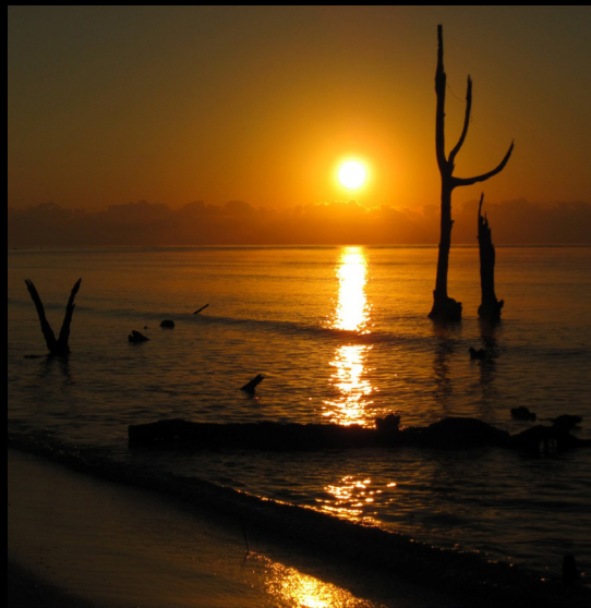
Amanecer Sur de Cancun