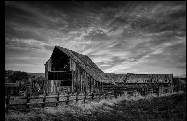
Ramshackle Barn - Claud Richmond