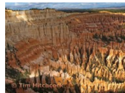
BOS Travel, Group 2 Tim Hitchcock