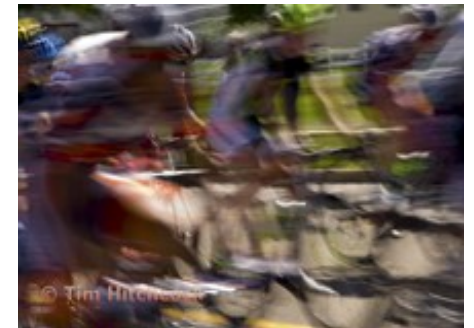
AOM Topic, Group 2 Tim Hitchcock