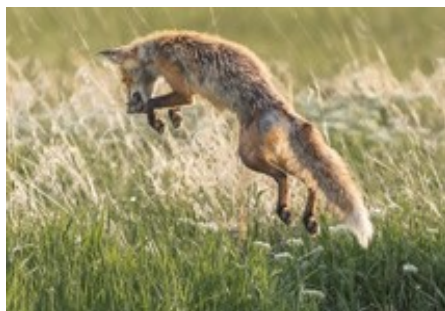
AOM Topic, Group 5 Dan O'Donnell