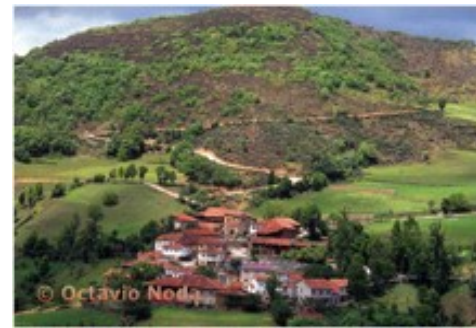
AOM Travel, Group 2 Octavio Noda