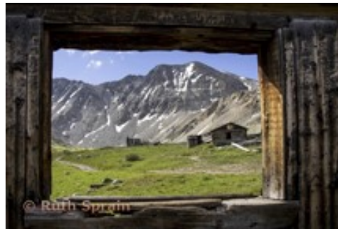
AOM Travel, Group 3 Ruth Sprain