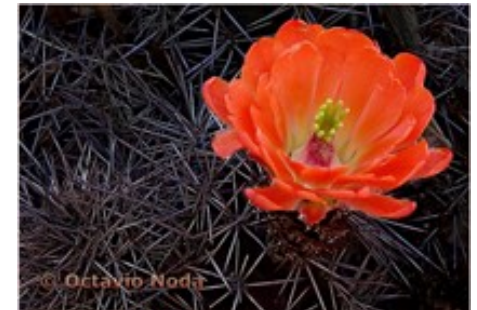
AOM Open, Group 2 Octavio Noda