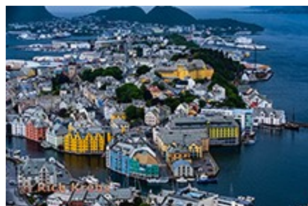
BOS Travel, Group 3 Rich Krebs