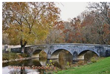
BOS Travel, Group 2 Wayne Snodderly