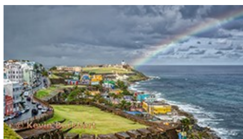
AOM Travel, Group 4 Kevin Burkhart