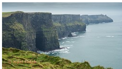
AOM Travel, Group 4 Kurt Flock