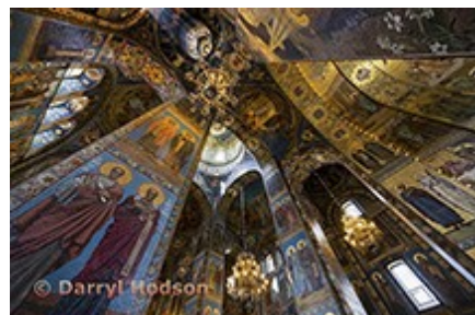
AOM Travel, Group 5 Darryl Hodson