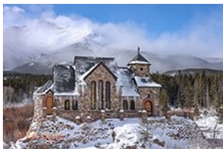
BOS Travel, Group 4 Ed Ogle