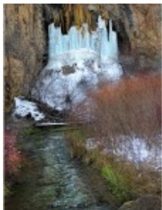
BOS Open, Group 2 Octavio Noda