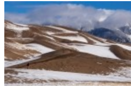
AOM Topic, Group 4 Ruth Sprain