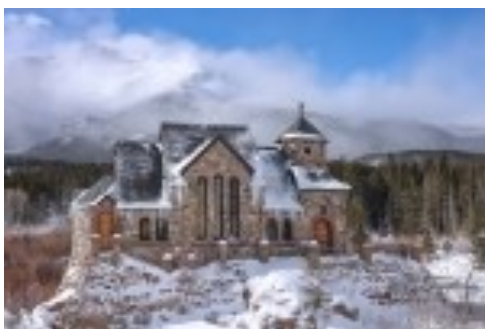
BOS Topic, Group 3 Ed Ogle