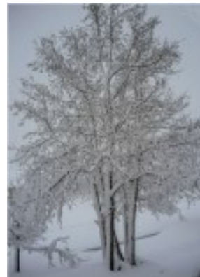
AOM Topic, Group 2 Octavio Noda