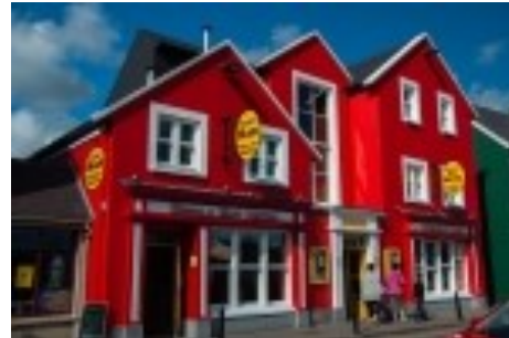
AOM Open, Group 2 Rich Krebs