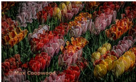
AOM Topic, Group 5 Max Coopwood