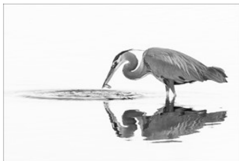
"Water Ripples—Blue Heron" Omar Pena