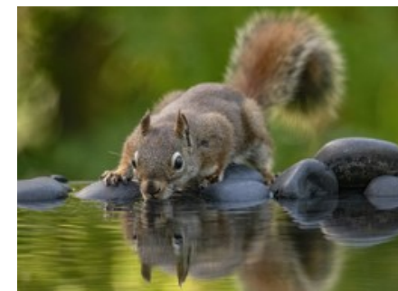
"Red Squirrel Delight"—J.R. Schnelzer