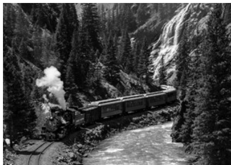
"Morning in the Canyon"—Jerry Baumann