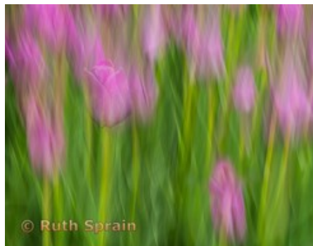
BOS Topic, Group 4 Ruth Sprain