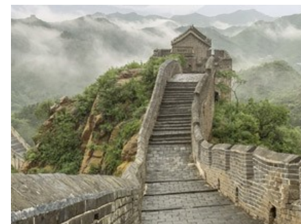
"The Impressive Wall"—J.R. Schnelzer