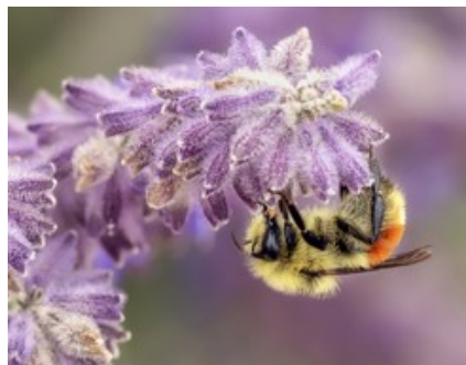
"Sleeping Bee"—Omar Pena