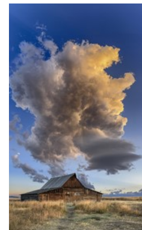
"Barn and Sky" J.R. Schnelzer