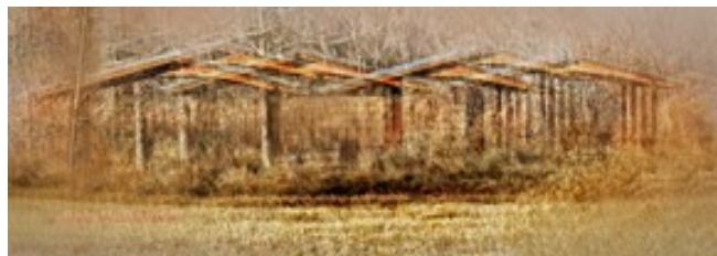
BOS Topic, Group 3 Bob McDonnell