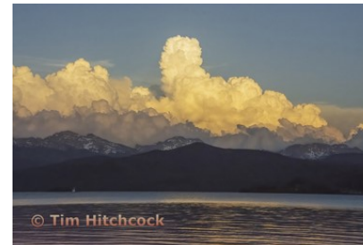
AOM Topic, Group 4 Tim Hitchcock