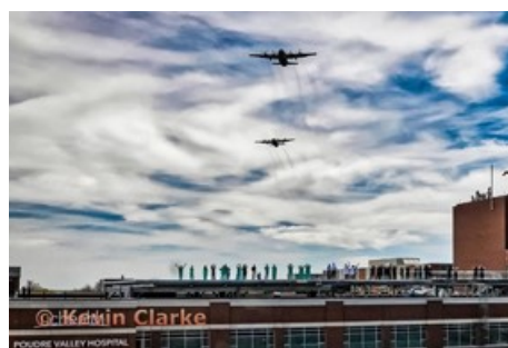
AOM Topic, Group 3 Kevin Clarke