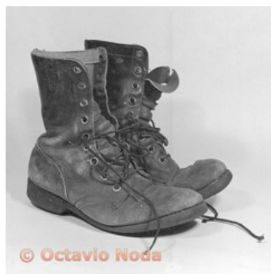
AOM Monochrome, Group 3 Octavio Noda