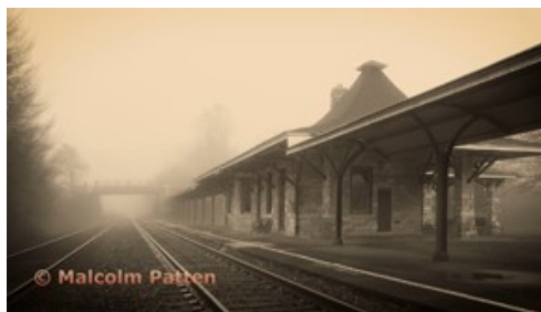
BOS Monochrome, Group 4 Malcolm Patten