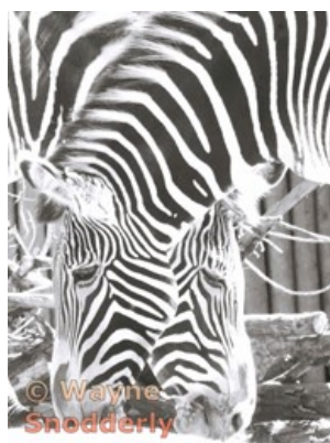
AOM Monochrome 2 Wayne Snodderly