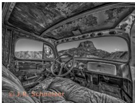
AOM Monochrome, Group 5 J.R. Schnelzer