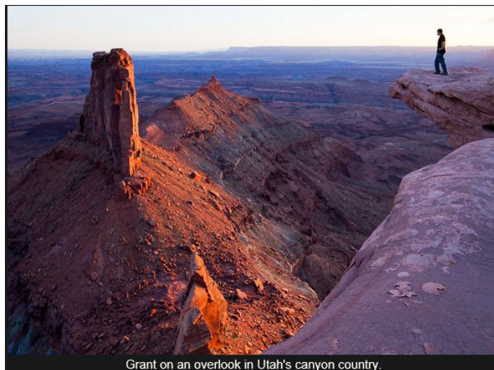
Grant on an overlook in Utah's canyon country.