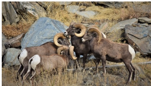
Open AOM Sterling Brody