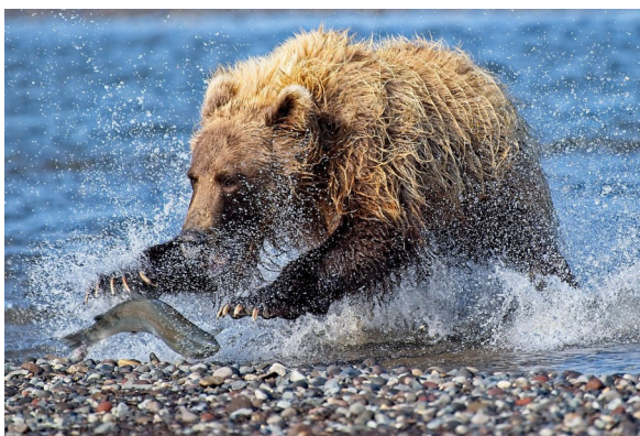
"Catching Salmon"—Bob Smith

LPS members who are interested in having their photos considered for our club's submissions to a PSA interclub competition can contact the LPS rep for more details.