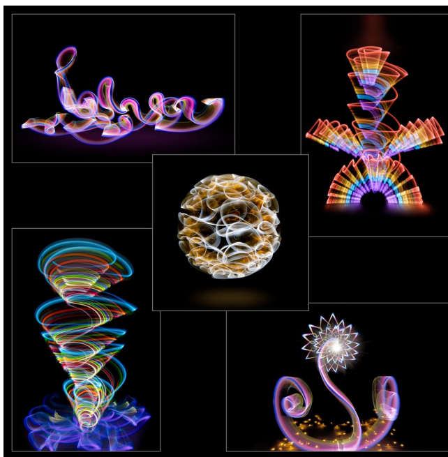
Examples of light painting by Jeanie Sumrall-Ajero