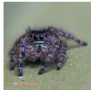
BOS Topic, Group 4 Ed Ogle