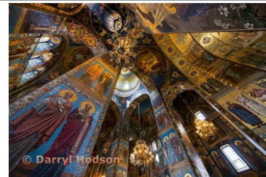
AOM Travel, Group 5 Darryl Hodson