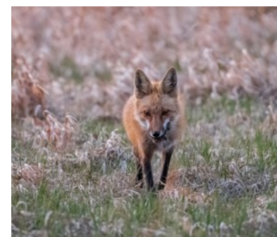
AOM Topic, Group 5 Dan O'Donnell