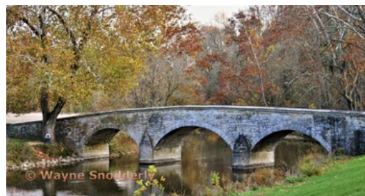
BOS Travel, Group 2 Wayne Snodderly