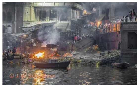
AOM Travel, Group 5 J.R. Schnelzer