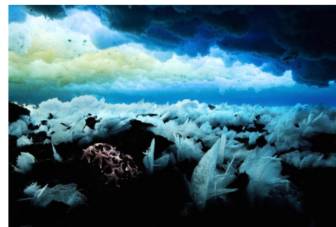
Seastars and Anchor Ice