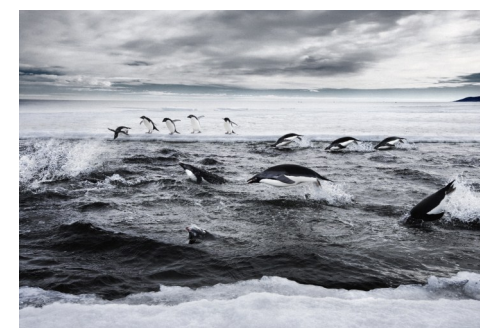
Adelie Penguins Hunting